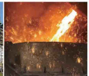
Metallurgy & Mining