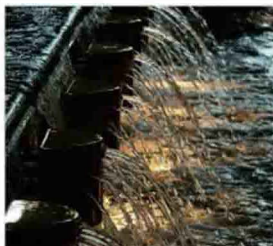
Water & Waste Water